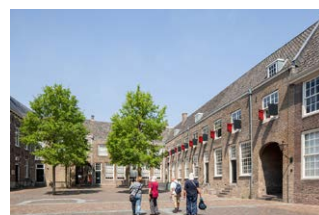
Het Hof van Nederland Museum, Dordrecht, NL