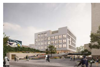
Heerlen City Hall and Municipal Offices, Heerlen, NL