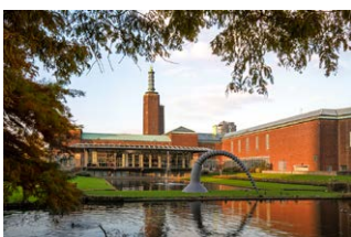
Museum Boijmans Van Beuningen, Rotterdam, NL